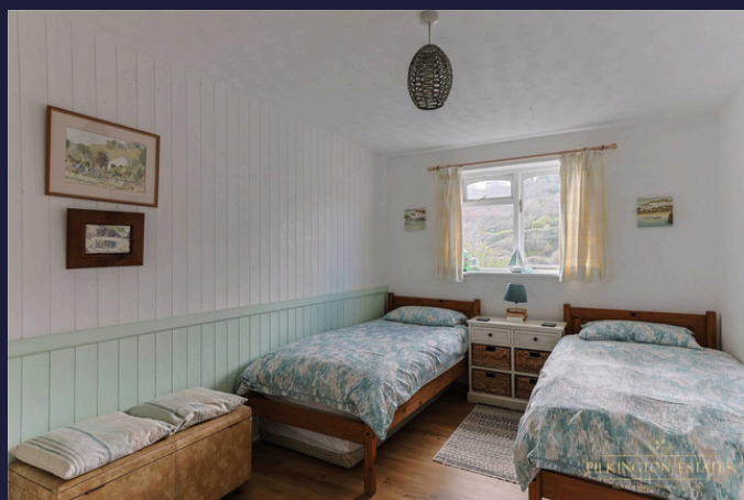
Sea View Cottage