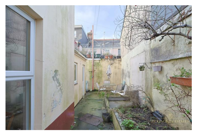
Pilkington Estates - Plymouth Third Floor, Unit 7, Sutton Harbour, Plymouth Devon, PL4 0DN

TOTAL FLOOR AREA: 1249 Sq.11, (13.6 sq.m.) approx. Whilst every attempt has been made to ensure the accuracy of the focusian contained here; measurement of abox, windows, norms and any other them are approximate and no responsibility is staten for any error mission or mis-statement. This plan is for it is flastarthey reprospectively and should be used as such by any prospective purchaser. The services, systems and appliances shown have not been tested and no guarant as to their operationally or efficiency can be given.