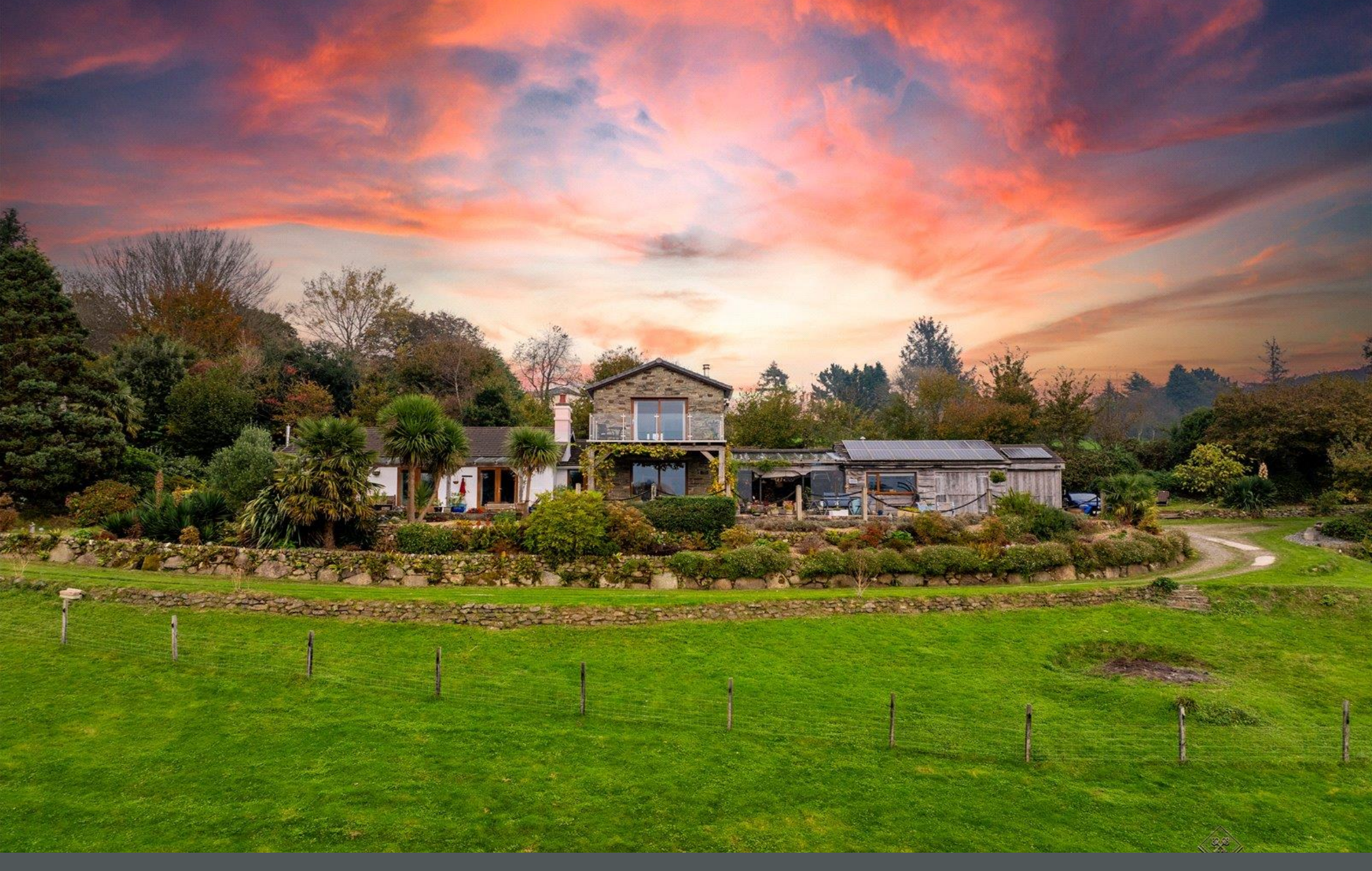
Kelly Gardens, Calstock, Cornwall, PL18