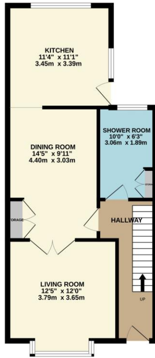
GROUND FLOOR 546 sq.ft. (50.7 sq.m.) approx.