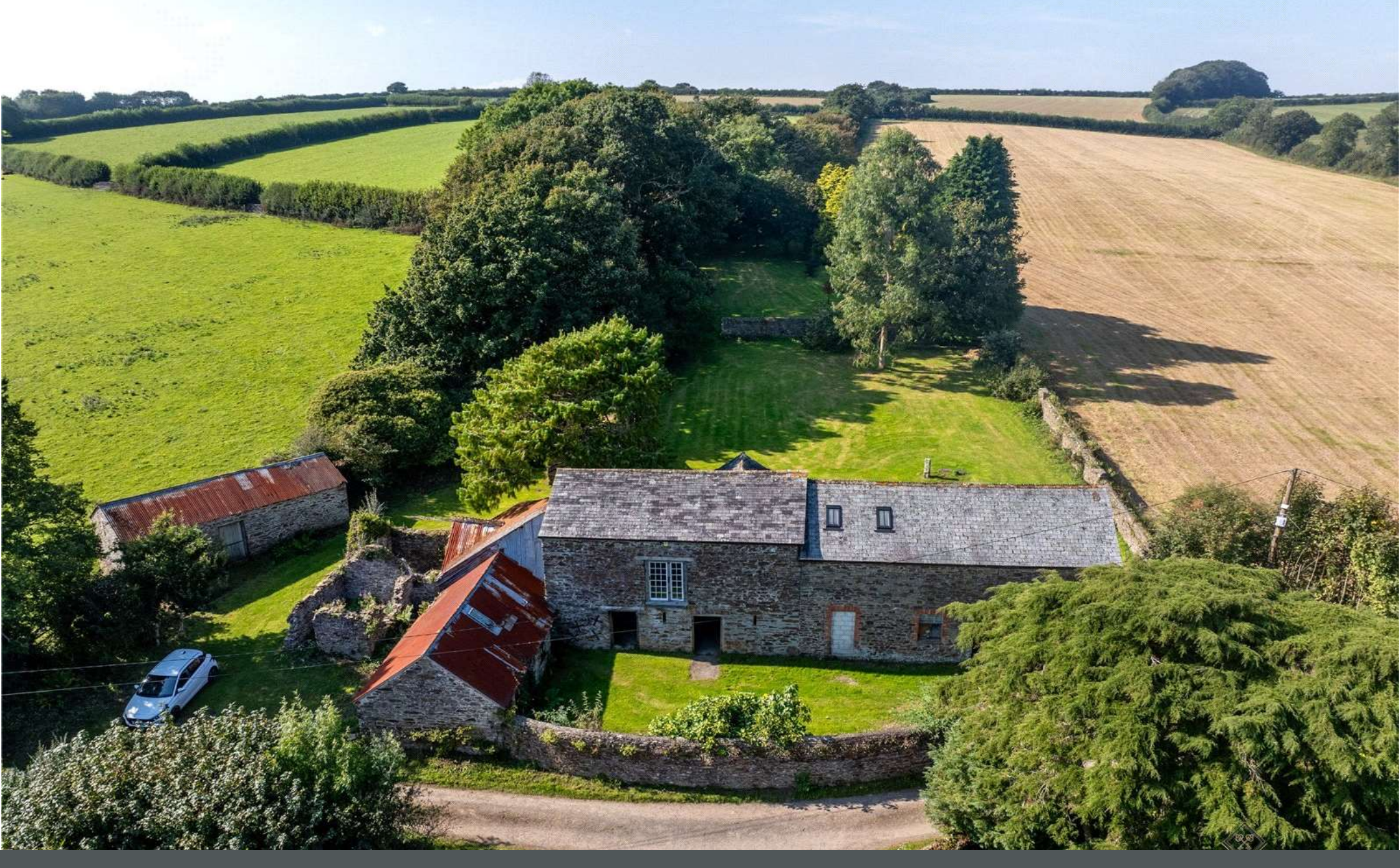
St. Keyne, Liskeard, Cornwall, PL14