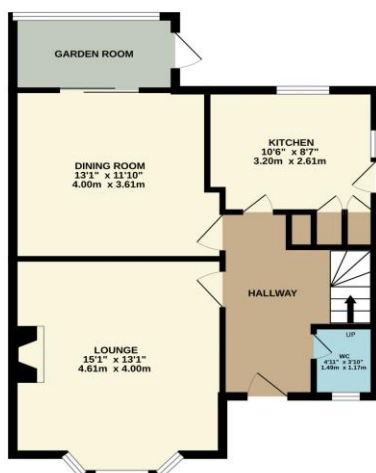
GROUND FLOOR 595 sq.ft. (55.3 sq.m.) approx.